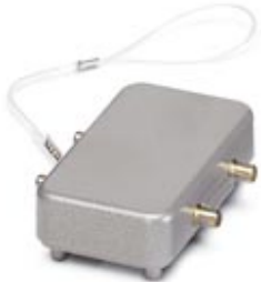
HEAVYCON protective cover, type B10, for supporting base element with double locking latch, with retaining cord, IP65, ALU

Please be informed that the data shown in this PDF Document is generated from our Online Catalog. Please find the complete data in the user's documentation. Our General Terms of Use for Downloads are valid ( http://phoenixcontact.com/download )