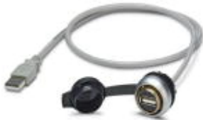
USB service socket, 1.0 m

Service socket with USB (socket/plug), type A with 1.0 m cable