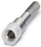
Female test connector, color: silver

Female test connector - PSBJ 3/13/4 - 0201304