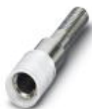
Female test connector, color: transparent

Female test connector - PSBJ 4/15/6 FARBLOS - 0303419