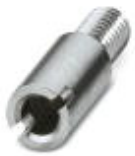
Female test connector, color: silver

Female test connector - PSB 3/10/4 - 0601292