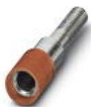
Female test connector, color: red

Female test connector - PSBJ 4/15/6 RD - 0303325