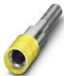
Female test connector, color: yellow

Female test connector - PSBJ 4/15/6 YE - 0303367