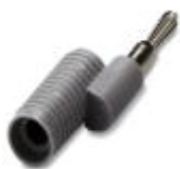
Reducing plug, color: gray