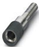
Female test connector, color: black

Female test connector - PSBJ 4/15/6 BK - 0303406