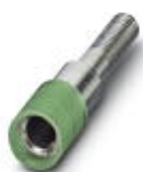
Female test connector, color: green

Female test connector - PSBJ 4/15/6 GN - 0303370