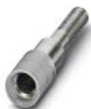
Female test connector, color: gray

Female test connector - PSBJ 4/15/6 GY - 0303396