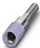
Female test connector, color: violet

Female test connector - PSBJ 4/15/6 VT - 0303383