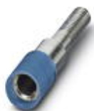
Female test connector, color: blue

Female test connector - PSBJ 4/15/6 BU - 0303354