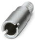
Female test connector, color: silver

Female test connector - PSB 4/7/6 - 0303299