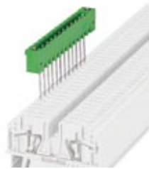
The illustration shows a 12-position version

Please be informed that the data shown in this PDF Document is generated from our Online Catalog. Please find the complete data in the user's documentation. Our General Terms of Use for Downloads are valid ( http://phoenixcontact.com/download )