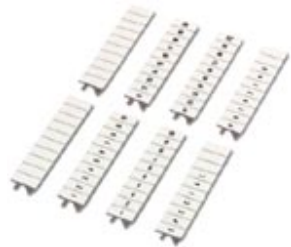
Zack marker strip, 10-section, vertically labeled with the consecutive numbers: 1 ... 10, white, width: 5 mm

Please be informed that the data shown in this PDF Document is generated from our Online Catalog. Please find the complete data in the user's documentation. Our General Terms of Use for Downloads are valid ( http://phoenixcontact.com/download )