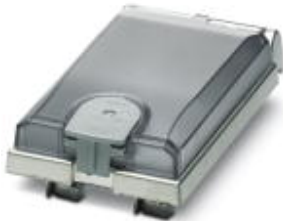
Mounting frame, for one front plate or socket, metal frame, matt nickel-plated, electrically conductive, transparent cover

Please be informed that the data shown in this PDF Document is generated from our Online Catalog. Please find the complete data in the user's documentation. Our General Terms of Use for Downloads are valid ( http://phoenixcontact.com/download )