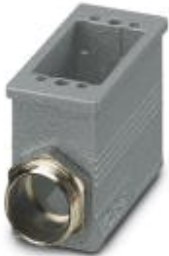
Box mounting base, made of metal, powder-coated type 2, number of modules 3, cable screw connection Pg21

Please be informed that the data shown in this PDF Document is generated from our Online Catalog. Please find the complete data in the user's documentation. Our General Terms of Use for Downloads are valid ( http://phoenixcontact.com/download )