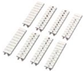
Zack marker strip, 10-section, vertically labeled with the consecutive numbers: 11 ... 20, white, width: 5 mm

Please be informed that the data shown in this PDF Document is generated from our Online Catalog. Please find the complete data in the user's documentation. Our General Terms of Use for Downloads are valid ( http://phoenixcontact.com/download )