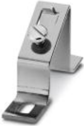
Angled brackets with M6 screw, DIN rail limit stop, for fixing DIN rails at an angle of 30°, height: 46 mm

Please be informed that the data shown in this PDF Document is generated from our Online Catalog. Please find the complete data in the user's documentation. Our General Terms of Use for Downloads are valid ( http://phoenixcontact.com/download )