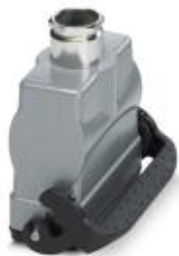
HEAVYCON B16 coupling housing, with single locking latch, height: 82 mm, with 1 x Pg21 screw connection, straight cable outlet

Please be informed that the data shown in this PDF Document is generated from our Online Catalog. Please find the complete data in the user's documentation. Our General Terms of Use for Downloads are valid ( http://phoenixcontact.com/download )