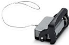
HEAVYCON protective cover, type B10, for sleeve housing without single locking latch, with retaining cord, IP65, ALU

Please be informed that the data shown in this PDF Document is generated from our Online Catalog. Please find the complete data in the user's documentation. Our General Terms of Use for Downloads are valid ( http://phoenixcontact.com/download )