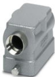
HEAVYCON B6 sleeve housing, for single locking latch, height: 56 mm, with 1 x M25 gland, lateral cable outlet

Please be informed that the data shown in this PDF Document is generated from our Online Catalog. Please find the complete data in the user's documentation. Our General Terms of Use for Downloads are valid ( http://phoenixcontact.com/download )