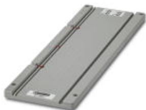
Magazine, for CMS-P1-PLOTTER and PLOTMARK, for accommodating UC-EMP..., UC-EMLP...

Please be informed that the data shown in this PDF Document is generated from our Online Catalog. Please find the complete data in the user's documentation. Our General Terms of Use for Downloads are valid ( http://phoenixcontact.com/download )