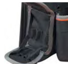
Drill bit pocket