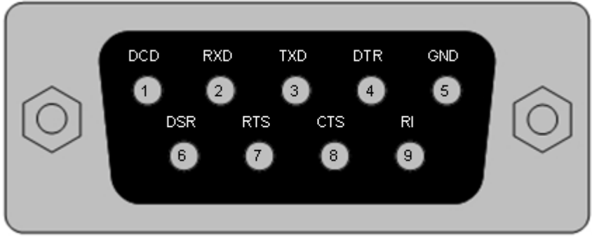
Figure 3-1 RS232 DB9 Pin Out