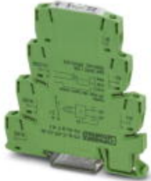
Timer relay with off delay (with control contact) and an adjustable time range (3 s - 300 s), with screw connection

Please be informed that the data shown in this PDF Document is generated from our Online Catalog. Please find the complete data in the user's documentation. Our General Terms of Use for Downloads are valid ( http://phoenixcontact.com/download )