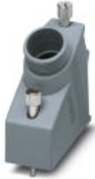
Plastic sleeve housing, locking screws with knurled head, type 2, cable screw connection Pg21

Please be informed that the data shown in this PDF Document is generated from our Online Catalog. Please find the complete data in the user's documentation. Our General Terms of Use for Downloads are valid ( http://phoenixcontact.com/download )