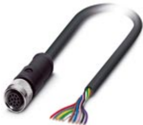
Master cable, 12-position, PUR/PVC, black RAL 9005, free cable end, on Socket straight M12, A-coded, Cable length: 5 m

Please be informed that the data shown in this PDF Document is generated from our Online Catalog. Please find the complete data in the user's documentation. Our General Terms of Use for Downloads are valid ( http://phoenixcontact.com/download )