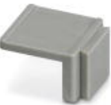
Equipment marker, narrow

Marking material - EMG-SGKS 10 - 2947585