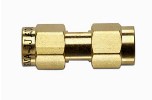
Model 72964 SMA PLUG (M) / PLUG (M)

High bandwidth, small size, and durability for confident connections.