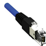
Without Pull Tab PNs 2159683/684