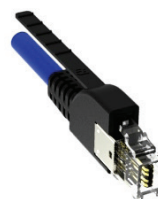
With Pull Tab PNs 2100356/357 PNs 2142758/759