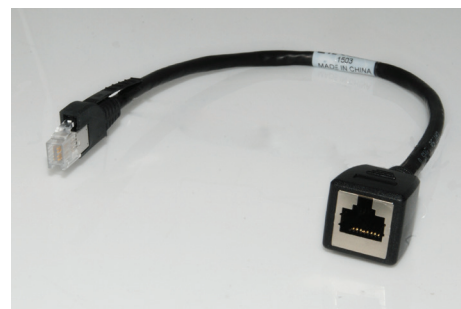
RJ point five Coupler PN 2159658-*