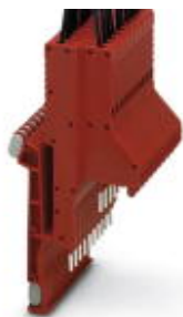
Test plugs, Color: red

Please be informed that the data shown in this PDF Document is generated from our Online Catalog. Please find the complete data in the user's documentation. Our General Terms of Use for Downloads are valid ( http://phoenixcontact.com/download )