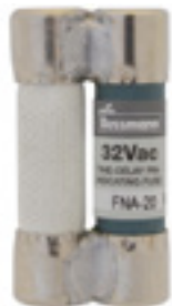
32Vac 20 to 30A