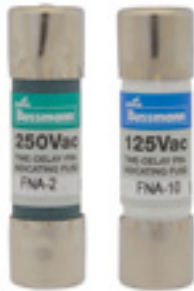
250Vac 1/10 to 6A 125Vac 6-1/4 to 10A