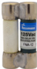
125Vac 12 to 15A