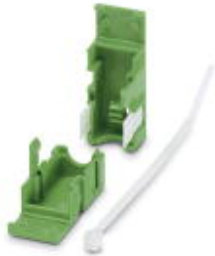
Cable housing, Pitch: 0 mm, Number of positions: 2, Dimension a: 10 mm, Color: green

Please be informed that the data shown in this PDF Document is generated from our Online Catalog. Please find the complete data in the user's documentation. Our General Terms of Use for Downloads are valid ( http://phoenixcontact.com/download )