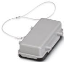
HEAVYCON protective cover, B16 series, for sleeve housing with double locking latch, with retaining cord, IP54, with seal

Please be informed that the data shown in this PDF Document is generated from our Online Catalog. Please find the complete data in the user's documentation. Our General Terms of Use for Downloads are valid ( http://phoenixcontact.com/download )