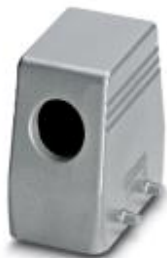
HEAVYCON B10 sleeve housing, for double locking latch, height: 72 mm, with 1 x M32 thread, lateral cable outlet

Please be informed that the data shown in this PDF Document is generated from our Online Catalog. Please find the complete data in the user's documentation. Our General Terms of Use for Downloads are valid ( http://phoenixcontact.com/download )