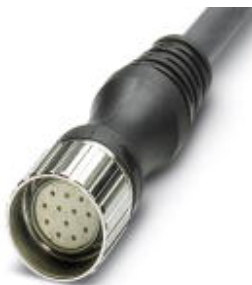
M23 socket, straight, 12-pos., with 5 m master cable, pin 9 and 10 bridged

Please be informed that the data shown in this PDF Document is generated from our Online Catalog. Please find the complete data in the user's documentation. Our General Terms of Use for Downloads are valid ( http://phoenixcontact.com/download )