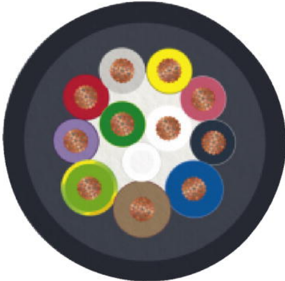
Cable cross section