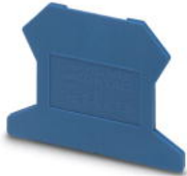
End cover, Length: 42.5 mm, Width: 1.5 mm, Height: 42 mm, Color: blue

Please be informed that the data shown in this PDF Document is generated from our Online Catalog. Please find the complete data in the user's documentation. Our General Terms of Use for Downloads are valid ( http://phoenixcontact.com/download )