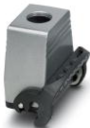
HEAVYCON coupling housing B10, with single locking latch, height 73 mm, with thread 1xM32

Please be informed that the data shown in this PDF Document is generated from our Online Catalog. Please find the complete data in the user's documentation. Our General Terms of Use for Downloads are valid ( http://phoenixcontact.com/download )