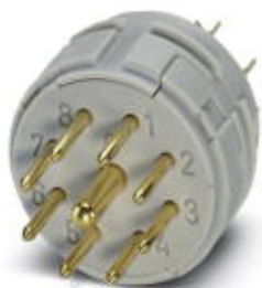
Contact insert, number of positions: 6+3, type of contact: Pin, Solder connection

Please be informed that the data shown in this PDF Document is generated from our Online Catalog. Please find the complete data in the user's documentation. Our General Terms of Use for Downloads are valid ( http://phoenixcontact.com/download )