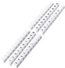
BNB Zack marker strip, 10-section, divisible, horizontally labeled with the consecutive numbers: 11 ... 20, white

Please be informed that the data shown in this PDF Document is generated from our Online Catalog. Please find the complete data in the user's documentation. Our General Terms of Use for Downloads are valid ( http://phoenixcontact.com/download )