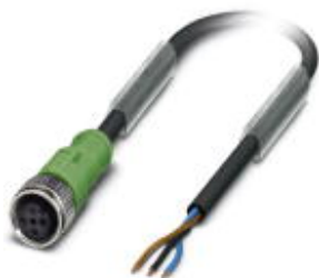
Sensor/actuator cable, 3-position, PUR, black-gray RAL 7021, free cable end, on Socket straight M12, A-coded, cable length: 12 m

Please be informed that the data shown in this PDF Document is generated from our Online Catalog. Please find the complete data in the user's documentation. Our General Terms of Use for Downloads are valid ( http://phoenixcontact.com/download )