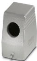
HEAVYCON B6 sleeve housing, for single locking latch, height: 72 mm, with 1 x M32 thread, lateral cable outlet

Please be informed that the data shown in this PDF Document is generated from our Online Catalog. Please find the complete data in the user's documentation. Our General Terms of Use for Downloads are valid ( http://phoenixcontact.com/download )