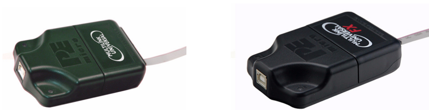
Figure 8-1: Multilink Universal (left) & Multilink Universal FX (right)