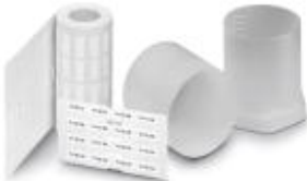
The figure shows the EML (20X8)R product variant

Label, Roll, white, unlabeled, can be labeled with: THERMOMARK ROLL, THERMOMARK ROLL X1, THERMOMARK X, THERMOMARK S1.1, Mounting type: Adhesive, Lettering field: d 17.5 mm