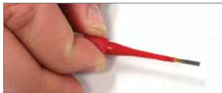
Plastic tool with contact in proper position.