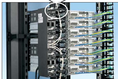
Complete POU Solution