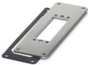
Adapter plates 2 mm thick, for panel cutouts of HC-B 24 size, including 1.5 mm flat gasket, size 3

Please be informed that the data shown in this PDF Document is generated from our Online Catalog. Please find the complete data in the user's documentation. Our General Terms of Use for Downloads are valid ( http://phoenixcontact.com/download )