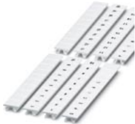
Zack marker strip, 10-section, horizontally labeled with the consecutive numbers: 21 ... 30, white, width: 8 mm

Please be informed that the data shown in this PDF Document is generated from our Online Catalog. Please find the complete data in the user's documentation. Our General Terms of Use for Downloads are valid ( http://phoenixcontact.com/download )