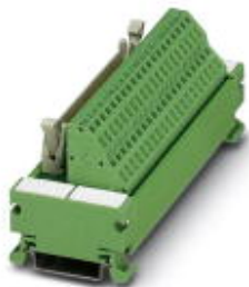
VARIOFACE COMPACT LINE, interface module for 32 channels, with LED, for assembly on DIN rail NS 35/7.5, spring-cage connection

Please be informed that the data shown in this PDF Document is generated from our Online Catalog. Please find the complete data in the user's documentation. Our General Terms of Use for Downloads are valid ( http://phoenixcontact.com/download )