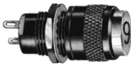
360-8430-0371-502 LH73/1; LC11RT2 Flat Lens