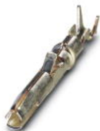
Rolled female contact, single contacts, silver-plated, 1.5 mm 2 ... 2.5 mm 2

Please be informed that the data shown in this PDF Document is generated from our Online Catalog. Please find the complete data in the user's documentation. Our General Terms of Use for Downloads are valid ( http://phoenixcontact.com/download )