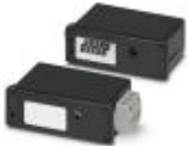
PROFIBUS (1.5 Mbps) communication module for EEM-MA600

Communication module - EEM-PB-MA600 - 2901368