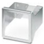
DIN rail adapter for EEM-MA600 and EEM-MA400 energy meters

DIN rail adapter - EEM-MKT-DRA - 2902078