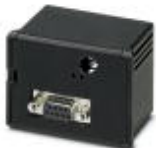
PROFIBUS (12 Mbps) communication module for EEM-MA600

Communication module - EEM-PB 12-MA600 - 2901418