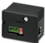
Gateway RS-485/Ethernet communication module for the EEM-MA600 with integrated web server

Communication module - EEM-ETH-RS485-MA600 - 2901374