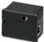
Ethernet communication module for the EEM-MA600 with integrated web server

Communication module - EEM-ETH-MA600 - 2901373