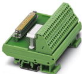
Standard 1:1 D-SUB module, with spring-cage connection and D-SUB socket strip, no. of positions 25

Please be informed that the data shown in this PDF Document is generated from our Online Catalog. Please find the complete data in the user's documentation. Our General Terms of Use for Downloads are valid ( http://phoenixcontact.com/download )