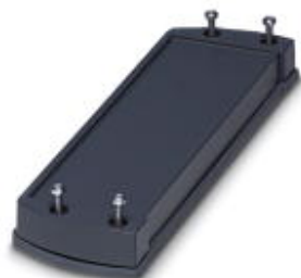
Panel mounting base, Side part, color: gray, width: 190.4 mm, height: 58 mm

Please be informed that the data shown in this PDF Document is generated from our Online Catalog. Please find the complete data in the user's documentation. Our General Terms of Use for Downloads are valid ( http://phoenixcontact.com/download )