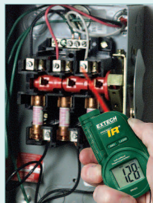
Troubleshooting for hot spots