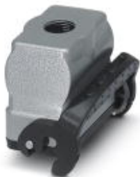
HEAVYCON coupling housing, with single locking latch, height: 77.5 mm, with 1 x M20 thread

Please be informed that the data shown in this PDF Document is generated from our Online Catalog. Please find the complete data in the user's documentation. Our General Terms of Use for Downloads are valid ( http://phoenixcontact.com/download )