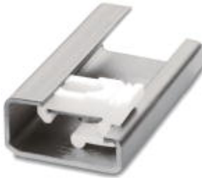
Rail adapter, snaps into NS 32 DIN rail, plastic with embedded M4 and M6 nuts, for attaching switchgear

Please be informed that the data shown in this PDF Document is generated from our Online Catalog. Please find the complete data in the user's documentation. Our General Terms of Use for Downloads are valid ( http://phoenixcontact.com/download )