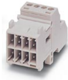
Contact insert module, for panel mounting frames, with screw connection, 8-pos., 160 V / 10 A

Please be informed that the data shown in this PDF Document is generated from our Online Catalog. Please find the complete data in the user's documentation. Our General Terms of Use for Downloads are valid ( http://phoenixcontact.com/download )