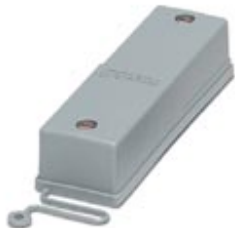
VARIOCON protective cover for the supporting base element and panel mounting frame, degree of protection: IP50, type: 4

Please be informed that the data shown in this PDF Document is generated from our Online Catalog. Please find the complete data in the user's documentation. Our General Terms of Use for Downloads are valid ( http://phoenixcontact.com/download )